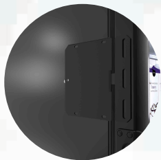
*optional insight lock

Energy efficient, eco-friendly HC refrigerant with low charge, spark-free components, and the lowest utility costs in its category.